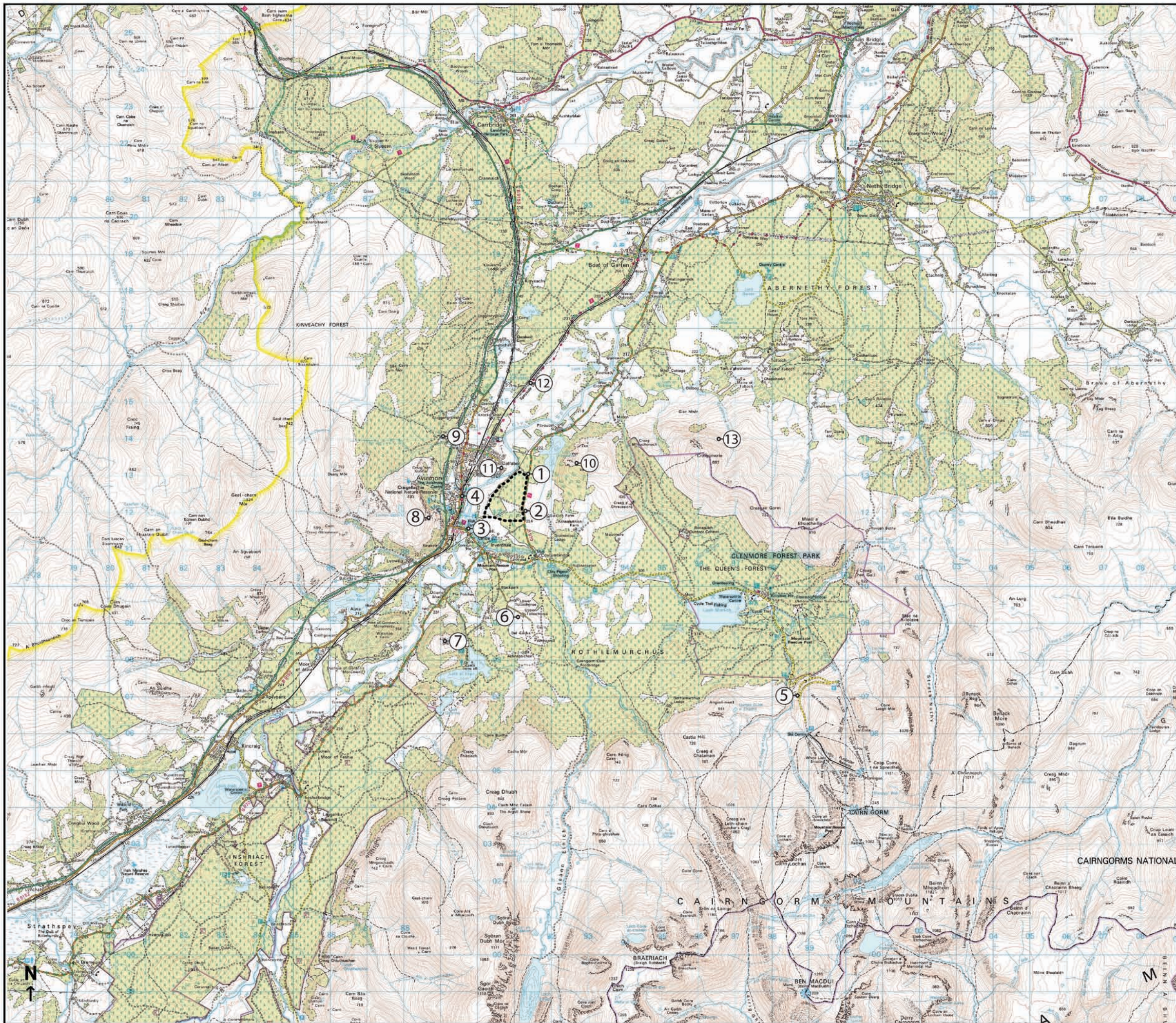
FIGURE: 3.4 Title: Viewpoint Location