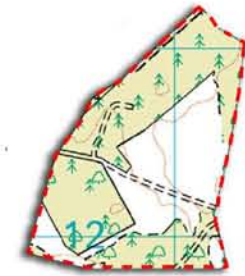
Photo Location Number and Direction of View