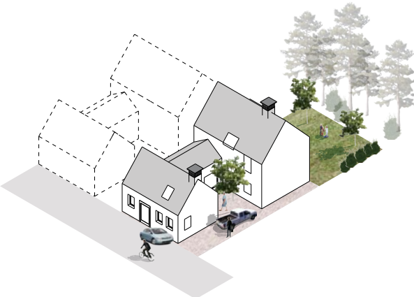
Courtyard house axonometric

The courtyard could be a useful private space, with a sheltered microclimate.