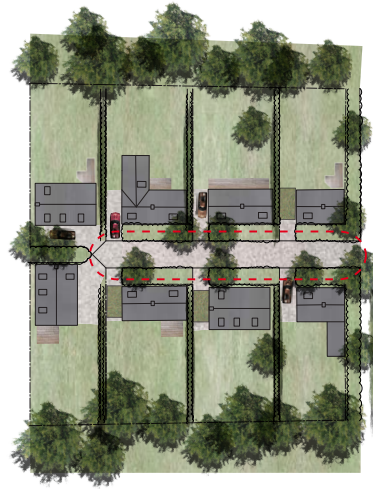
Buildings shaping the street space

Coherent streetscapes would be required; to be achieved by design guides that can be amended from a standard, to allow a wide choice of solutions for different neighbourhoods.