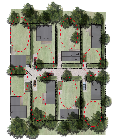
Staggered buildings for maximum light and minimal overlooking