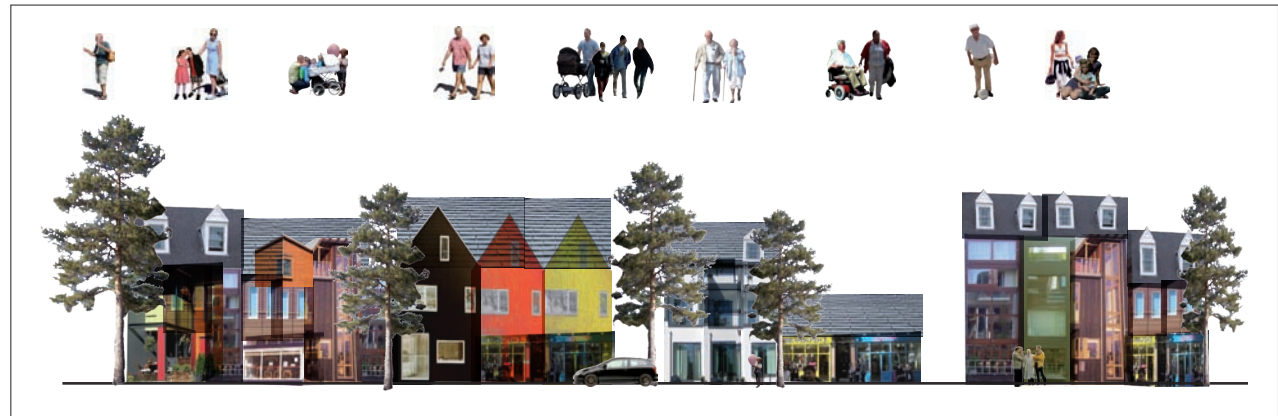
What should be on offer...

Additionally spaces for working, particularly premises for small businesses, offices and studios and workshops would be included within the settlement.