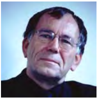
Jan Gehl Founding Partner Architect MAA, Int FRIBA, Hon. FAIA, Professor, Dr.Litt